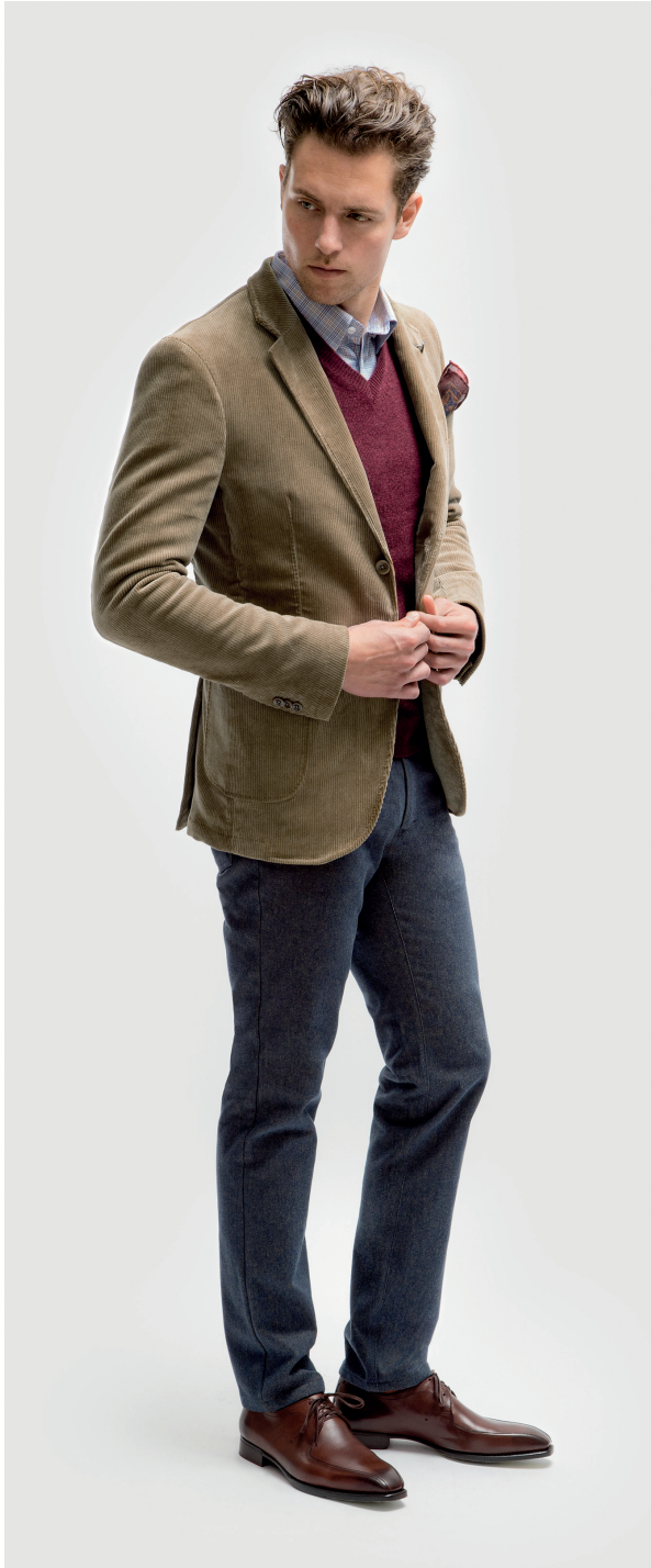
Suit Brisbane Moss Stretch Corduroy BM0078 Raincoat Di Pray PR0101