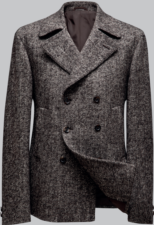
Vitale Barberis Canonico Herringbone Bouclé VB0314