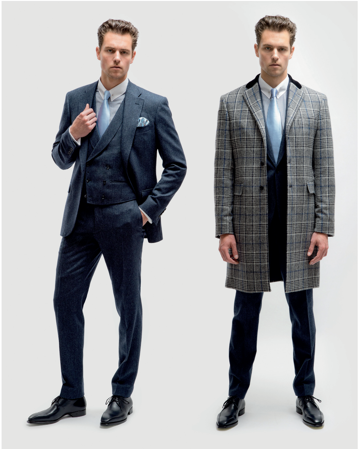
Suit Moon Lambswool Plain Weave MO0001 Shirt Getzner Poplin Coupé GE081 Chesterfield Di Pray Prince of Wales PR0124