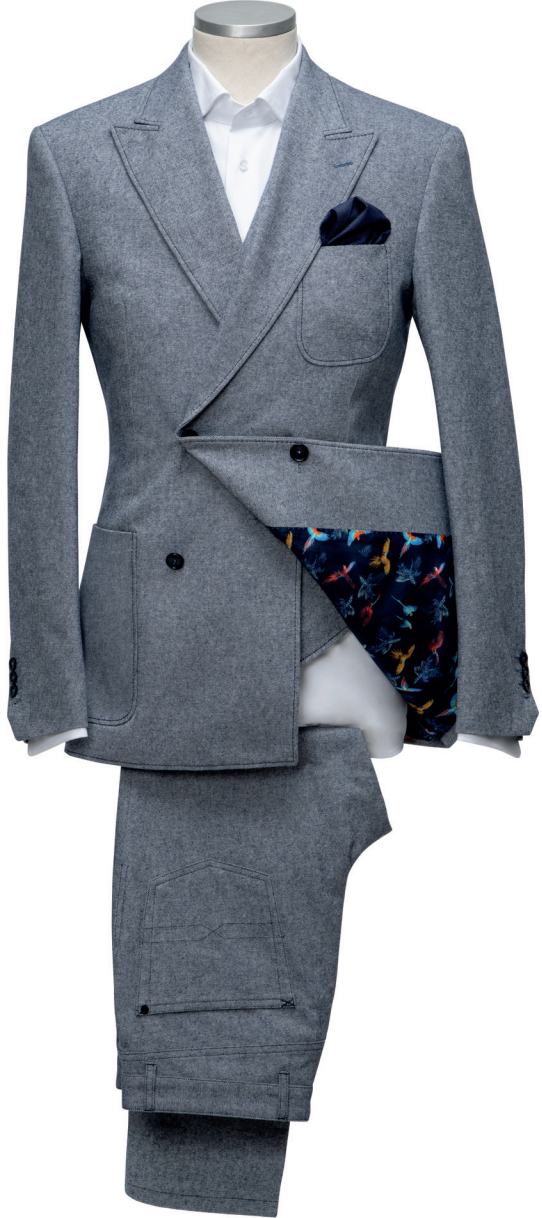
Suit Loro Piana 641004 Printed Lining SN031 White Heavyweight Shirt Albini AL139