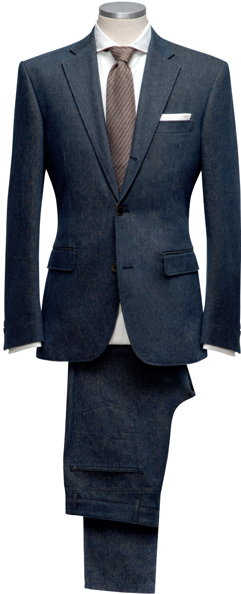
Suit Loro Piana 641017 Ecrú Heavyweight Shirt Albini AL140