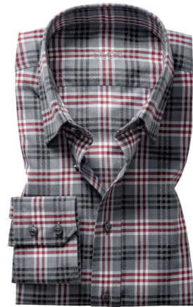
Blue Jeans Five Pocket Loro Piana 641017 Check Shirt Getzner Oxford GE075