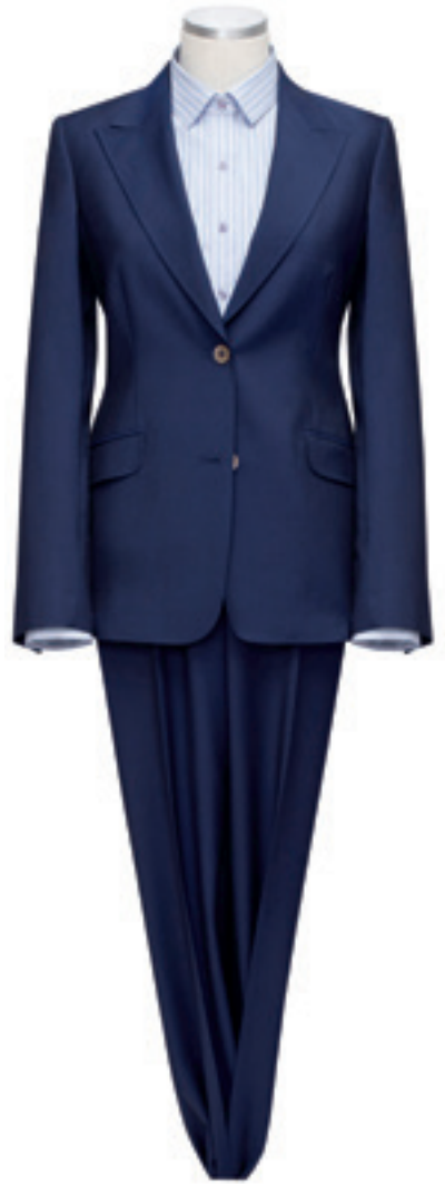
Costume Blue Fresco Vitale Barberis Canonico VB0175 Blouse Striped Poplin A0074